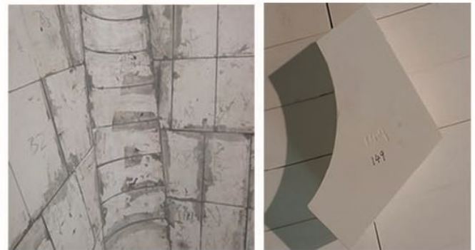
Ceramic Lined Bunker Revestimiento cerámico de Bunker