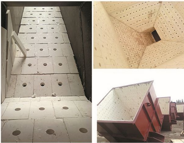
Alumina Ceramic Lined Hopper Tolva revestida de cerámica