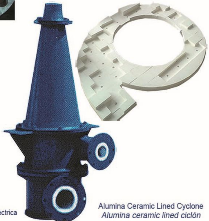
Alumina Ceramic Lined Cyclone Alumina ceramic lined ciclón